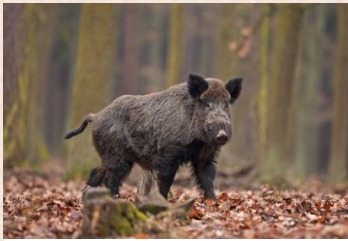
Wild Boar (Europe)