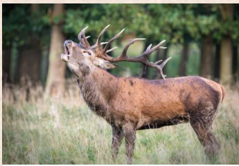
Red Deer/Red Stag (Europe)