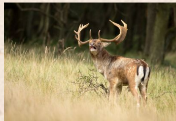
Fallow Deer (Europe)