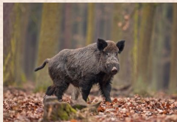
Wild Boar (Europe)