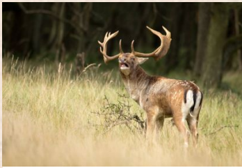
Fallow Deer (Europe)