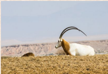
Scimitar Oryx/Scimitar-Horned Oryx