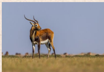
Red Lechwe/Black Lechwe/Kafue