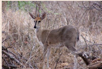
Duiker, Grey/Duiker, Grimm's (Common)