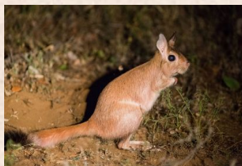
South African springhare