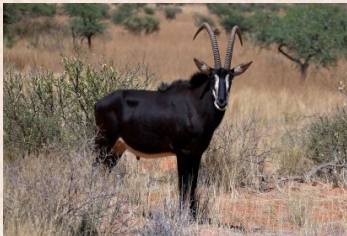
Sable Antelope (Africa)