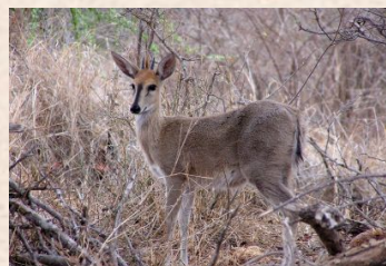
Duiker, Grey/Duiker, Grimm's (Common)