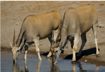
Eland, Cape/Livingstone, Patterson's