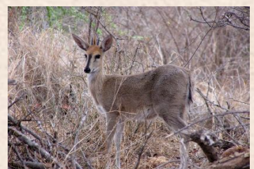
Duiker, Grey/Duiker, Grimm's (Common)