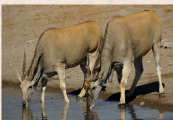
Eland, Cape/Livingstone, Patterson's