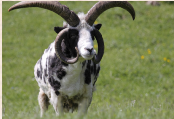
Multi-horned sheep (South America)