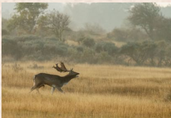
Fallow Deer (South America)