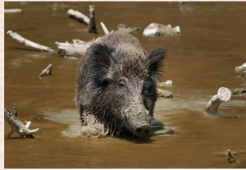
Wild Boar (Oceania)