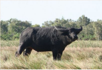
Wild Water Buffalo (Oceania)