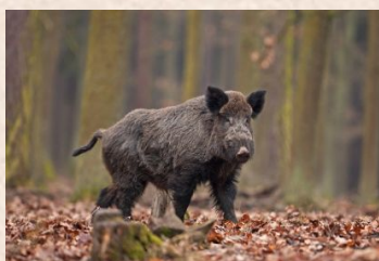
Wild Boar (Europe)