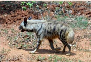
Hyena, Striped (Oceania)