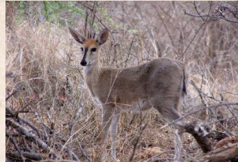
Duiker, Grey/Duiker, Grimm's (Common)