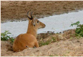
Reedbuck, Bohor/Reedbuck, Bohor