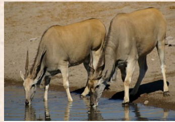
Eland, Cape/Livingstone, Patterson's