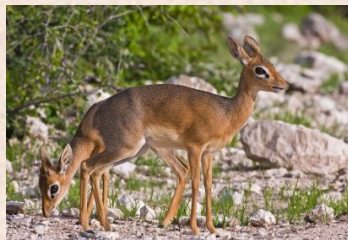
Kirk's Long Snouted Dik- Dik