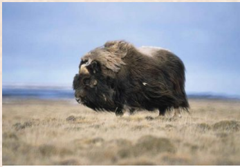
Musk Ox (North America)