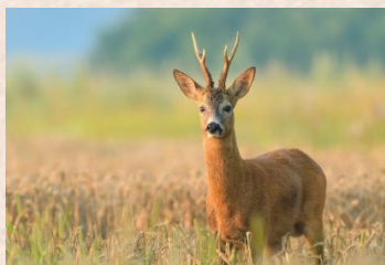
Buck/Roe Buck/Roe Deer (Europe)