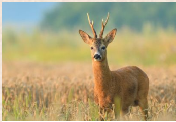
Buck/Roe Buck/Roe Deer (Europe)