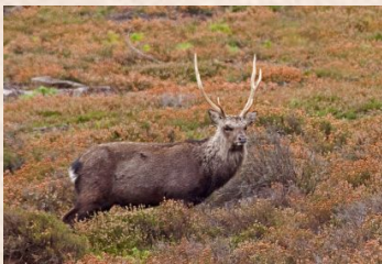
Sika Deer (Europe)