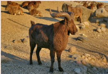
Tur, East Caucasian/Dagestan Tur